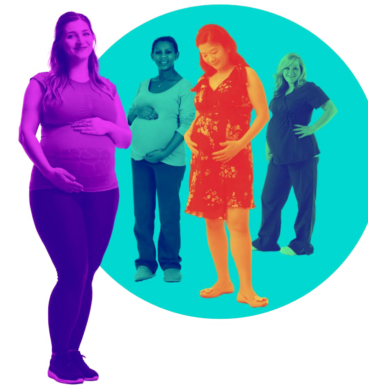
Support in Pregnancy