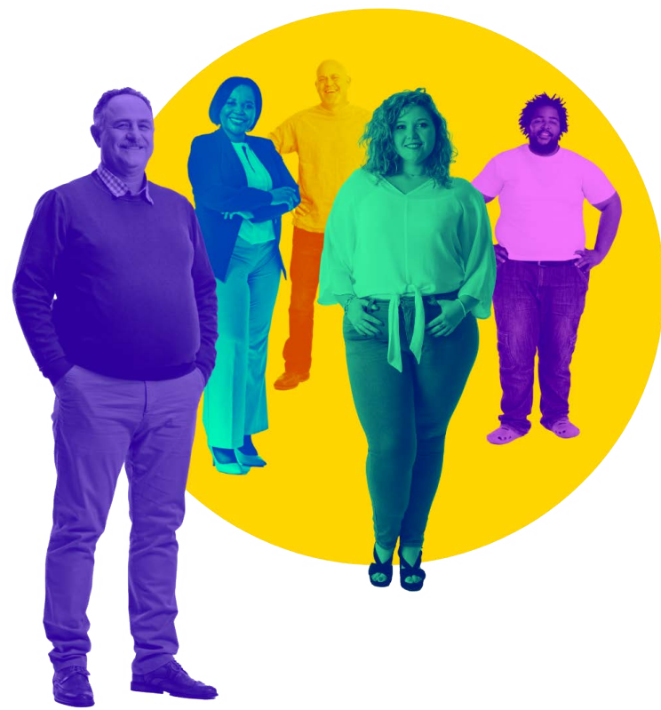
Support for Adults