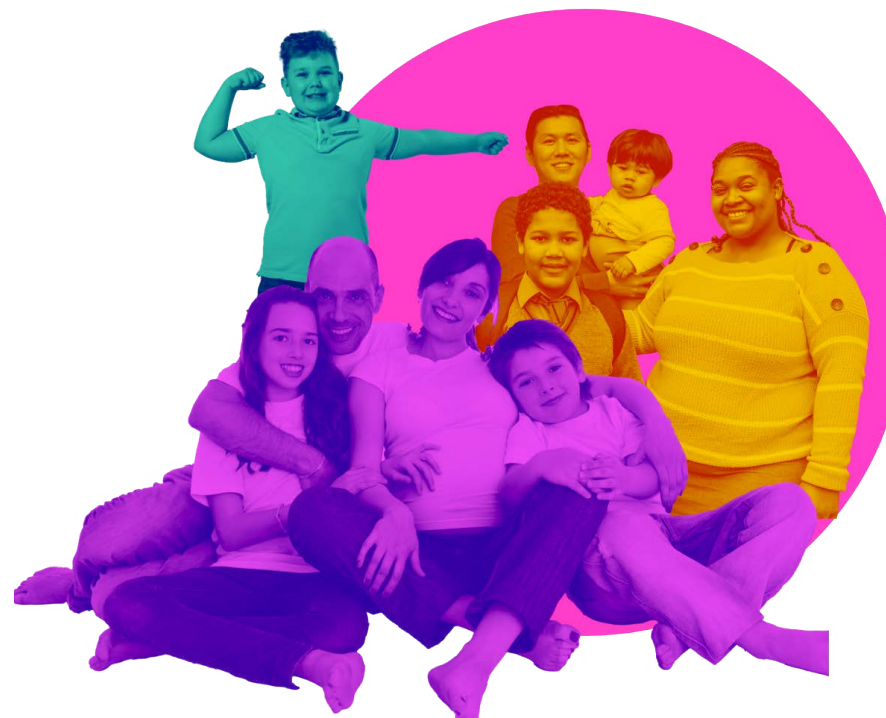
Support for Families